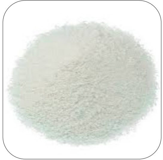
Ferrous Sulphate Monohydrate